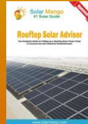
Rooftop Solar Advisor