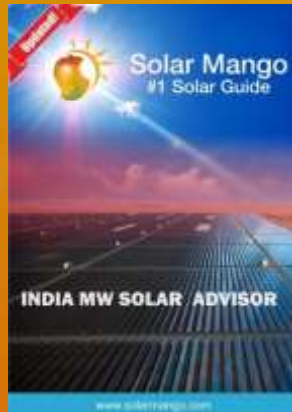
India MW Solar Advisor

Our research reports are industry acclaimed expert guides that give practical assistance and in-depth knowledge for anybody new to the Solar sector